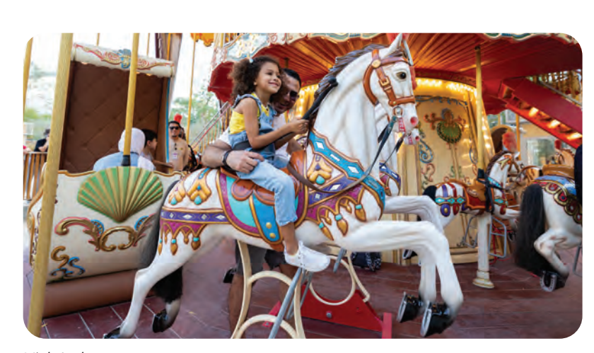
Kids' play area