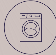
Laundry & Dry Cleaning