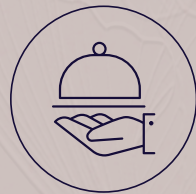
Food & Beverage Room Service